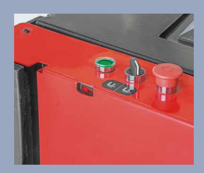
Automatic picking functions (OPT.) enable all kind of loads to be lifted or lower quickly and without fatigue