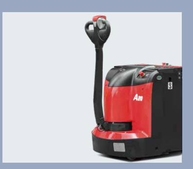
The truck benefits from a long tiller with a low mounting point ensuring a large safety clearance between operator & chassis